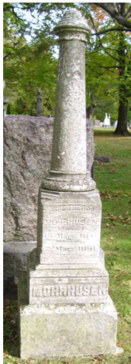
Headstones Provided for Deceased Union Civil War Veterans, 1879-1903