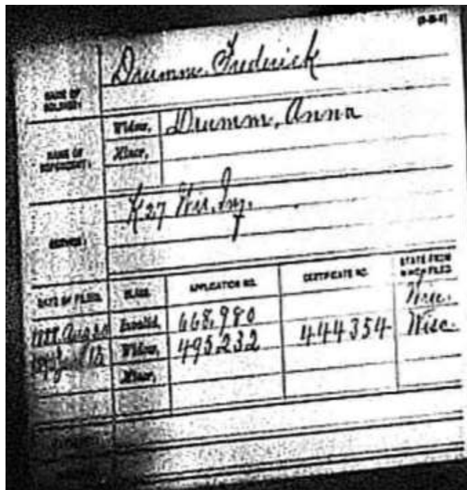
Civil War Pension Index, 1861-1937