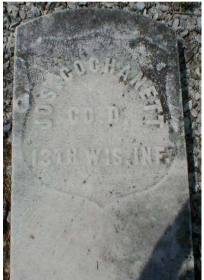
Headstones Provided for Deceased Union Civil War Veterans, 1897-1903